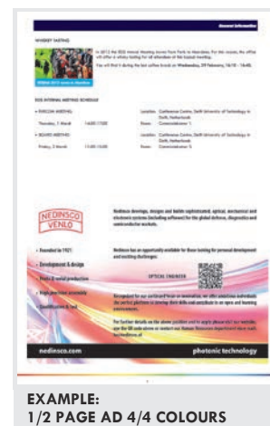
EXAMPLE: 1/2 PAGE AD 4/4 COLOURS

Different types of programme advertising: